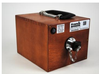
New battery pack with LED status monitor.