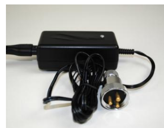
Intelligent switch mode battery charger with dual input 115/230v